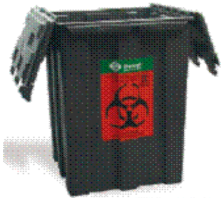
TB01 Reusable Container